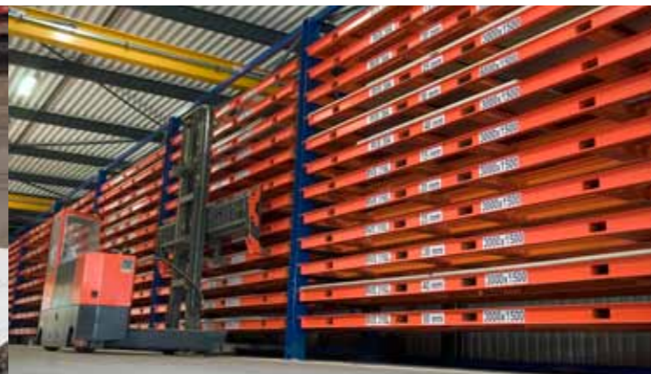
Stock material stainless steel