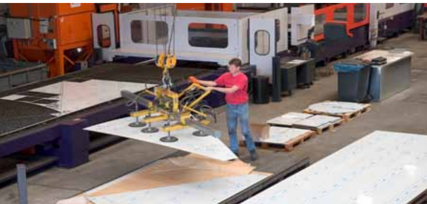
In-house laser cutting up to 3000 x 12000 mm.